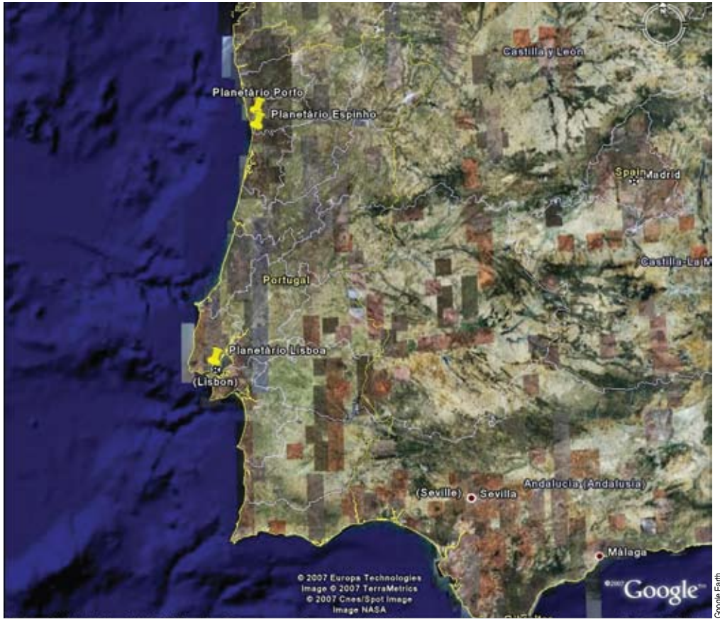
Figure 1 – Location of the largest planetarium theatres in Portugal (Lisboa 320 seats, Porto 100 seats and Espinho 80 seats).